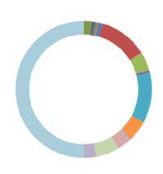
CHART OF SOURCES PROPORTIONS MOBILIZED FUNDING